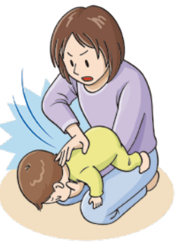
Figure 3 : Back blows ( Under the age of 1 )