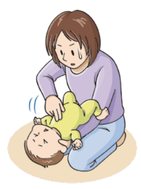
Figure 4 : Chest thrusts (Under the age of 1)

You can receive life-saving training at the nearest fire station.