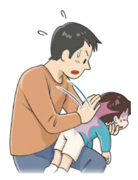
Figure 1 : Back blows (Age 1 and over)

fist on the upper abdomen, and press upward into the abdomen (Figure 2).